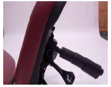
Once the seat head has been removed (refer to Seat Removal Instructions above) the gas cylinder will remain either with the seat ( Photo E ) or with the 5-Prong understructure assembly ( Photo F ). To remove the gas cylinder follow the below instructions. Gas Cylinder remaining with seat head ( Photo E ):